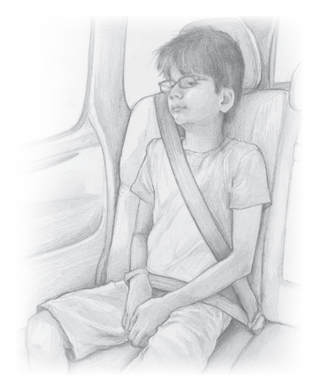
FIGURE 6. Lap and shoulder seat belt.