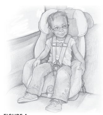
FIGURE 4. Forward-facing car safety seat with harness.